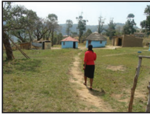
A parish nurse approaching an African village