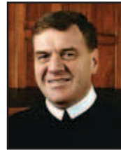
Joseph William Tobin, C.Ss.R.

The visitation, begun in 2009, sought to learn why the number of women religious in the U.S. had declined so sharply over the past forty years. But "what a lot of these women [religious] heard was someone telling them their life was not loyal and faith filled," the Archbishop said.