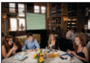
Participants take part in the Summer Institute

Some twenty young participants were introduced to the work of Catholic Relief Services, Catholic Charities USA, Catholic Medical Mission Board, the Catholic Church Extension Society and the U.S. Conference of Catholic Bishops.